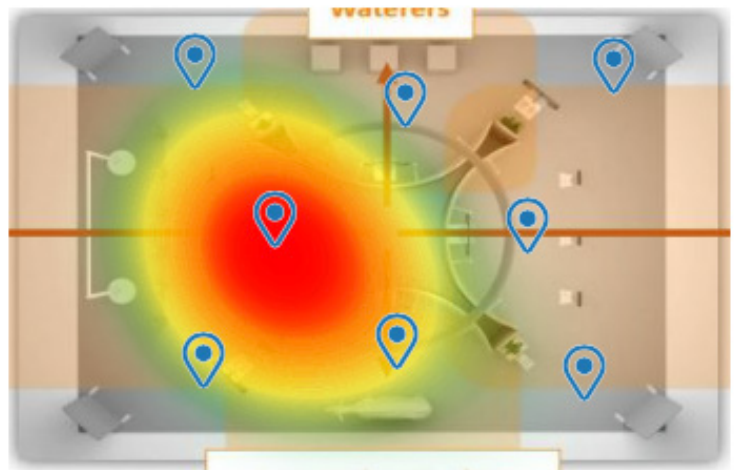
Booth Heat Map shows where the most traffic occurred